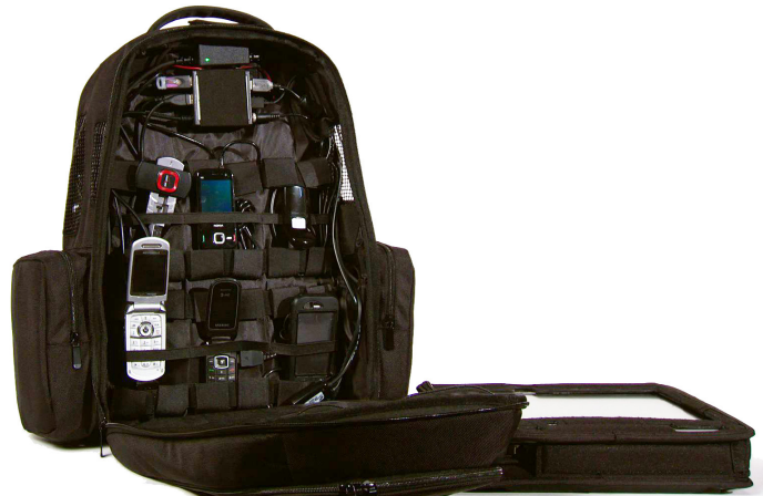
The backpack solution provides a user-comfortable setup that houses a W1314A/B receiver, batteries, charger, and room for up to eight phones/UEs.

The high-sensitivity GPS provides improved position reporting information even in the most challenging environments, from dense urban canyons to tunnels and underground locations. This option improves the quality of the reported measurement data and reduces instances of gaps in the reported position.