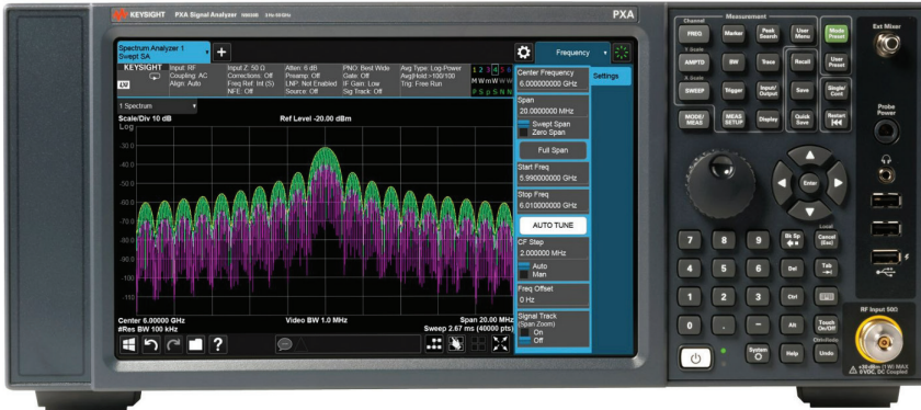
Keysight PXA Signal Analyzer