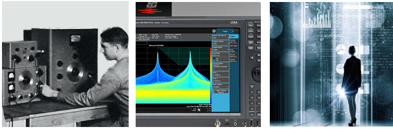
From Hewlett-Packard to Agilent to Keysight

Our unique combination of hardware, software, support, and people can help you reach your next breakthrough. We are unlocking the future of technology.