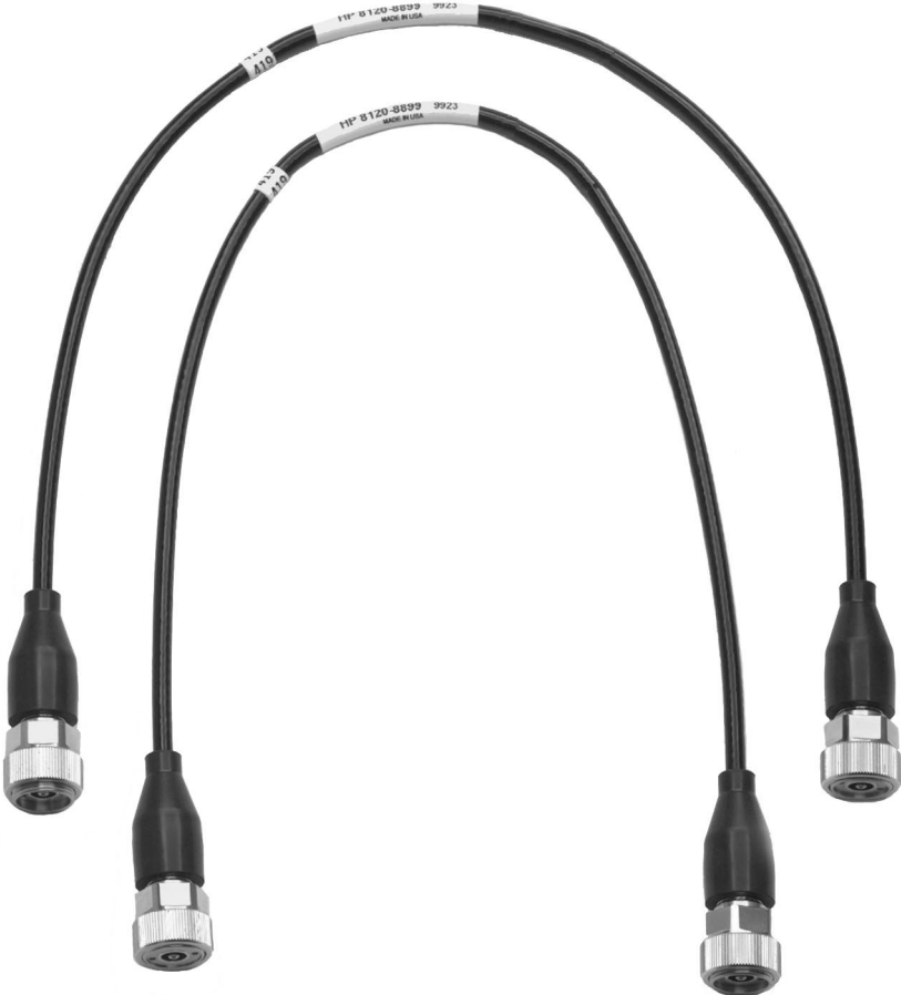
Figure 1. Model 11857D Cables, Option B24