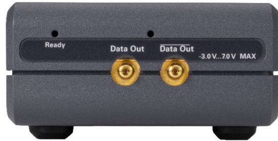
M8059A Remote head for M8042A