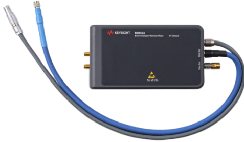
M8052A Remote head for M8043A

The M8052A remote head M8052A is required to operate the M8043A error analyzer module. The two cables on the back side of the remote head are used to connect with the M8043A error analyzer module. Using the remote head input of the M8043A module directly without the M8052A is prohibited.