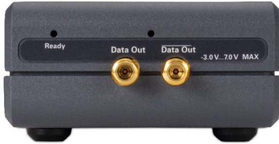
M8058A Remote head for M8042A

The M8058A (64 GBd) and the M8059A (120 GBd) remote heads can be ordered as individual products. The configuration system adds the correct type and quantity of remote heads based on the M8042A baud rate selection and the number of channels that are selected.