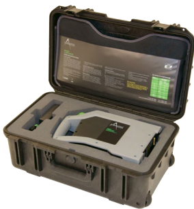
Portable transit case for analyzer and accessories.

Record data directly to laptop using interface cable and software.