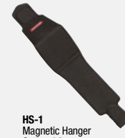
HS-1 Magnetic Hanger Optional Accessory