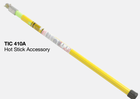
TIC 410A Hot Stick Accessory