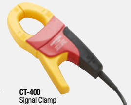
CT-400 Signal Clamp Optional Accessory