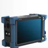
Platform FTB-2/FTB-2 Pro