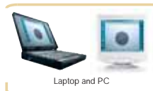
Laptop and PC