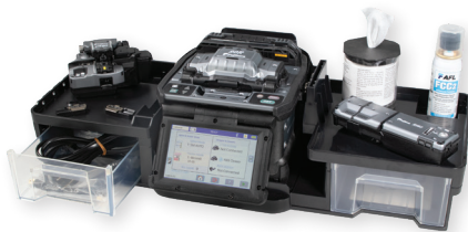
In Work Tray

The Fujikura 90R is the mass fusion splicer workhorse of the splicing world. As data demand continues to rise, the solution to handle the increased traffic is to increase fiber counts. As a result, fiber counts being utilized in enterprise data centers, campus, and metro networks have grown enough to make single fiber splicing too costly and timely. High density cabling made possible by SpiderWeb Ribbon® (SWR) and others like it are spurring ribbon splicing activity in places that have traditionally used loose fiber. The 90R is the answer to these changes in splicing demand. With automated splice start, tube heater, wind protector, cleave tracking, and blade rotations for up to 2 cleavers at a time, this splicer frees up operator time for other fiber preparation steps. New to the 90R, you can keep your splicer in the field longer with field replaceable V-grooves. When V-grooves can no longer be cleaned after extended use, or are accidentally damaged, you can resume splicing in minutes by installing the spare set included with your 90R kit. Put our 90R to the test by contacting us to see its capabilities first-hand, 1-800-235-3423.