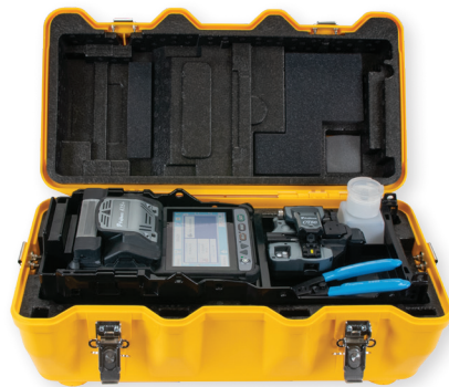
Workstation in Transit Case

Backed by the best service team in the industry, the Fujikura 41S+ is the ideal splicer to use when portability, ruggedness, and reliability are needed for splicing applications.