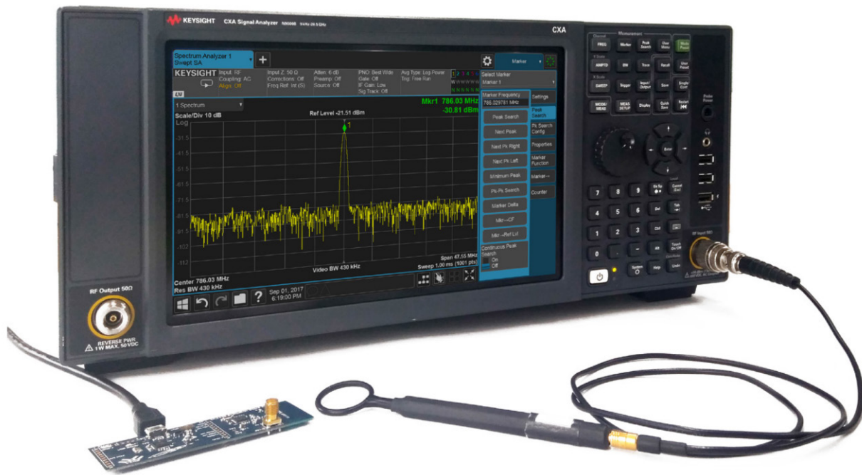
Figure 2. Near-field probe and CXA signal analyzer test the emission of PC LAN port during design cycle before full compliance testing

It can be difficult to tell where EMI failures are coming from since compliance tests themselves won't tell you where exactly the source of the problem is. Radiated emissions may come from a USB port, a LAN port, the seam of a shield, a cable, a buffer, a clock or even a power cord. You need to either troubleshoot yourself or obtain troubleshooting services from a lab or a third party. In this situation, near-field tests are the only way to locate such emission sources and is typically performed using a signal analyzer and a set of near-field probes.