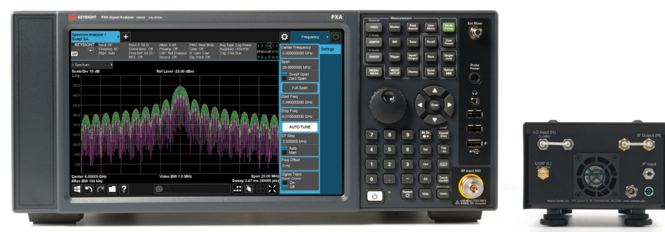
Keysight N9030B PXA Signal Analyzer Keysight N9029AV12 Frequency Extender