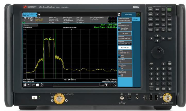
Keysight N9041B UXA Signal Analyzer